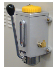
Optional EvenFlow™ reservoir and pump