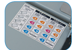
Clearly marked fold guide for quick and easy setup

The FD 300 Office Desktop Folder provides an economical solution for low-volume folding projects. This compact folder processes 11" and 14" paper at speeds up to 7,400 sheets per hour, and is clearly marked for 4 common fold settings.